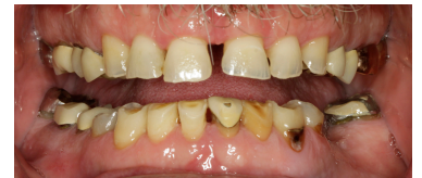
Provisionals with Lower Transitional Bonding